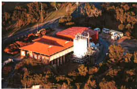
Existing DiCOM ® Bioconversion Facility Brockway Rd Shenton Park

To further reduce the quantity of our household waste disposed to landfill and to process all of the waste received at the transfer station, the WMRC and Anaeco propose that the AWT facility's capacity be increased to process up to 55,000 tonnes of household waste annually. This amount represents the original design capacity of the transfer station.