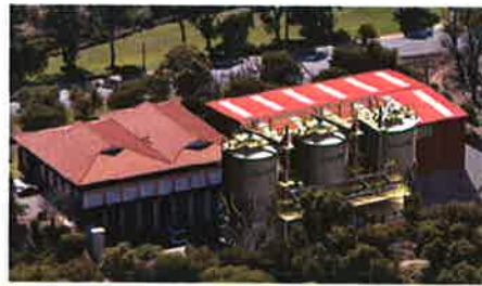
Artist's impression of proposed expanded facility

The DiCOM ® Bioconversion process is a patented, hybrid biological process which converts the organic content of household waste into compost and biogas. The waste is first mechanically sorted so that plastic, metals and glass are recovered for recycling. The remaining organic material is loaded into a vessel where it is warmed and subjected to aerobic and anaerobic digestion. The controlled batch-process closely mimics natural decomposition, but does so in conditions ideal for the micro-organisms which digest the waste. In this way the process is complete in about 21 days. As the digestion process all takes place within a sealed vessel, odour management is relatively straight forward.